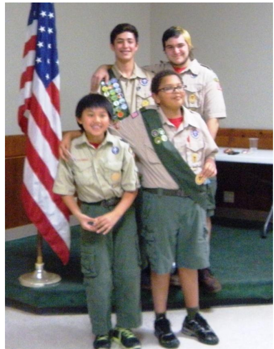
New Scribe and Blue Phoenix Patrol Leader