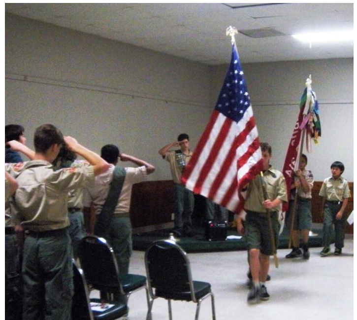
Colors are retired and it is time for desserts!