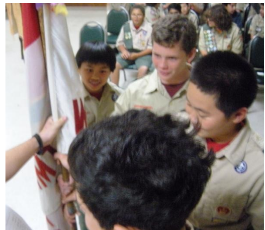
Swearing in new Officers