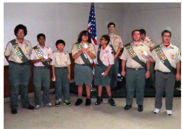
These Scouts Earned their Cooking Merit Badge – Not easy work on this one!