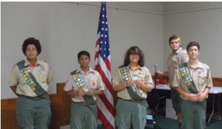
Merit Badges Awarded