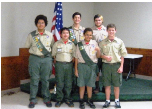
New Quartermaster, Librarian, Patrol Leader and Chaplin's Aide